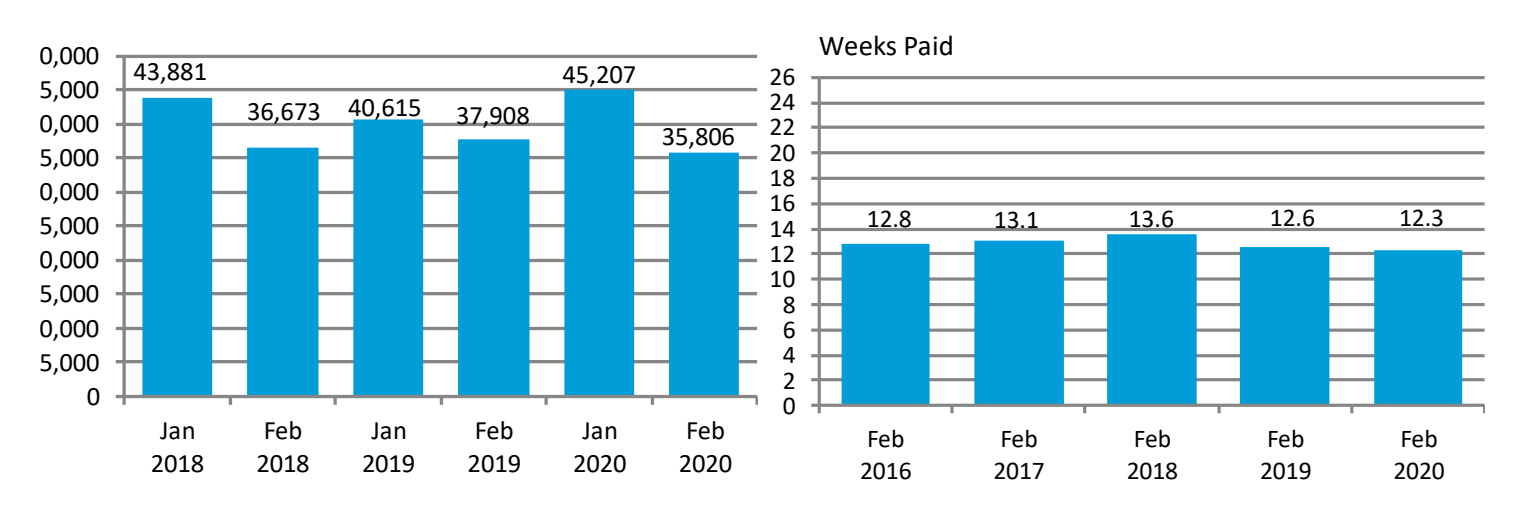
DURATION OF UI BENEFITS 12 MONTH AVG.